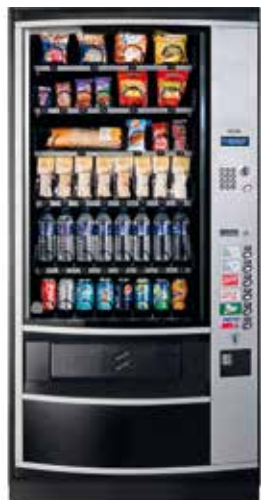
Palma+ H87 XtraDrinks