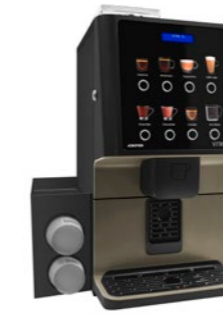
Cup module kit For dispensing cups.