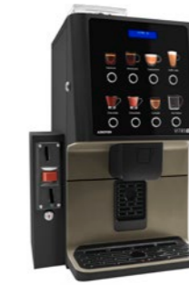
Validator module kit Ready to install a coin validator.