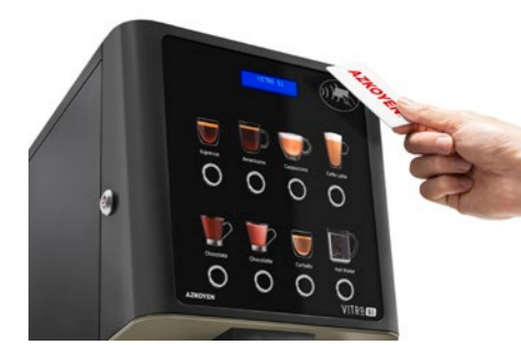
RFID Reader Kit For product recharge card or cashless systems